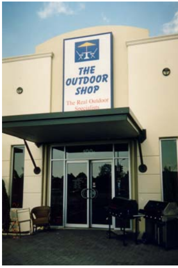
100 Anzac Highway, Showroom Warehouses.