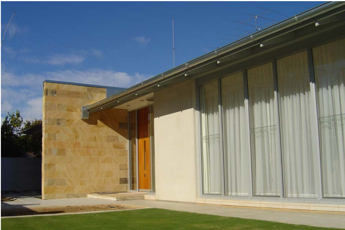
Private residence Kings Park.