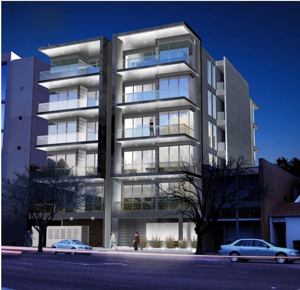
Proposed residential development South Terrace.