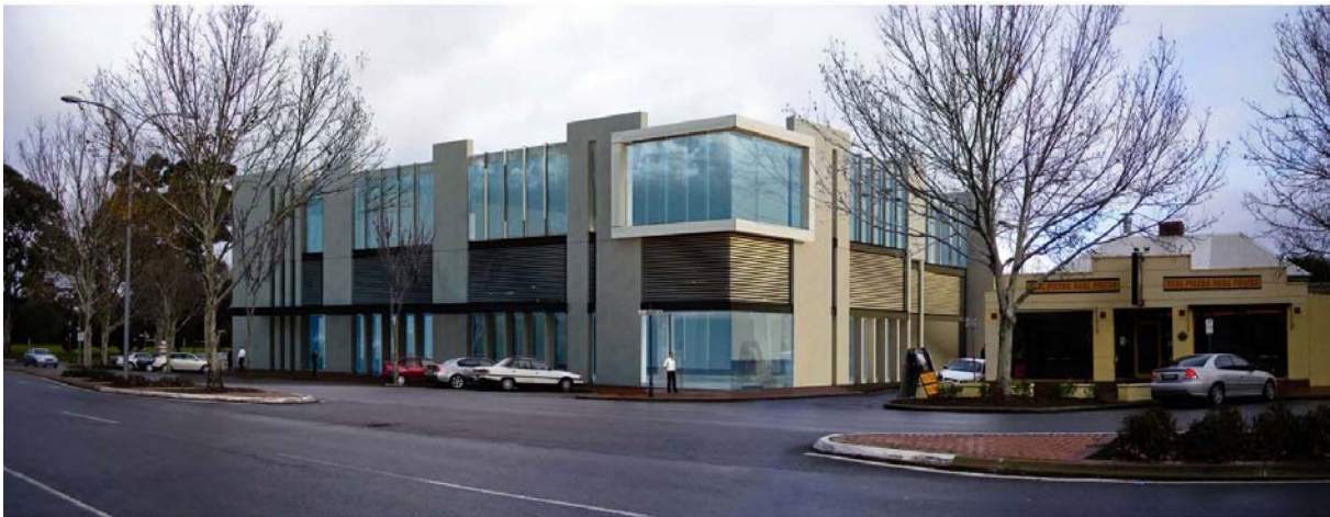
Proposed commercial development corner South Terrace and Hutt Street.