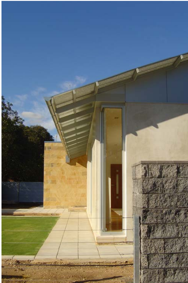
Private residence Kings Park.