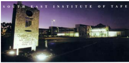
TAFE Mt. Gambier with Woods Bagot Architects.