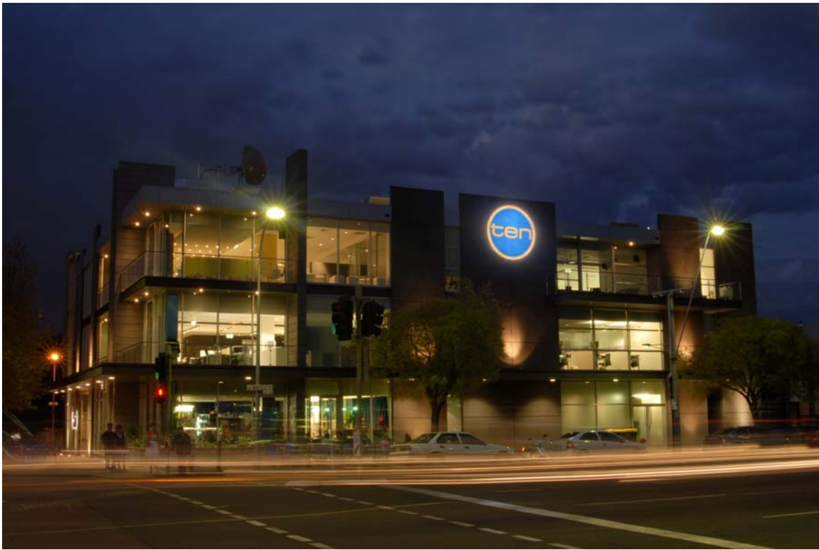
Network Ten Building corner Waymouth and Hutt streets Adelaide.with Genworth Group