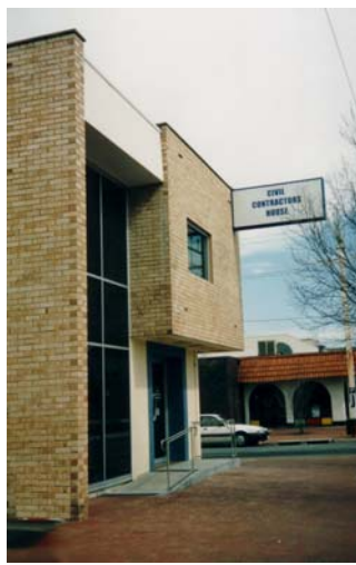
Earthmoving Contractors Association Head Office Fit Out, Woodville